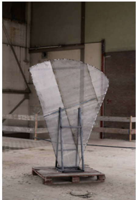
We may have lost some of the signification, 2021 (left)

AH! This reminds me of... no that's something else, 2021 (right)