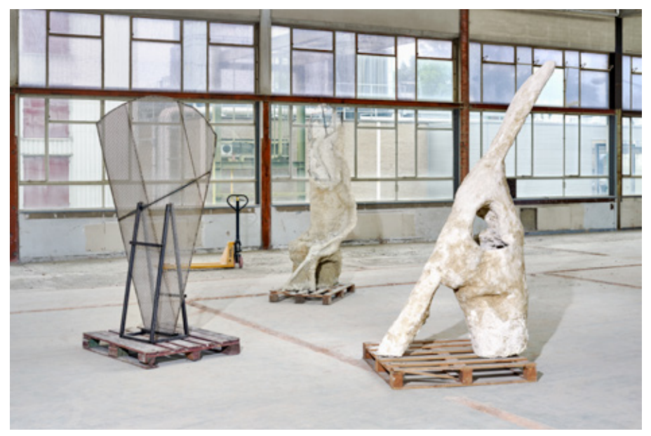
Lifetimes Lived Apart Triptych, 2021

(Pictured left) We may have lost some of the signification, 2021 (Pictured right) WAIT! It didn't go like that: Starting together, passing the other. We kind of move. You know?, 2021 (right)