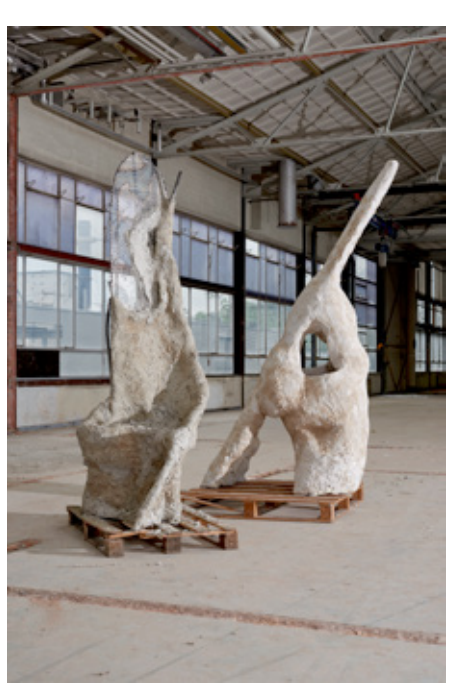
WAIT! It didn't go like that: Starting together, passing the other. We kind of move. You know?, 2021

(Pictured left) We may have lost some of the signification, 2021 (Pictured right) WAIT! It didn't go like that: Starting together, passing the other. We kind of move. You know?, 2021